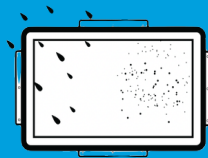
IP65 Front Glass