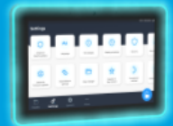
With LED Lights